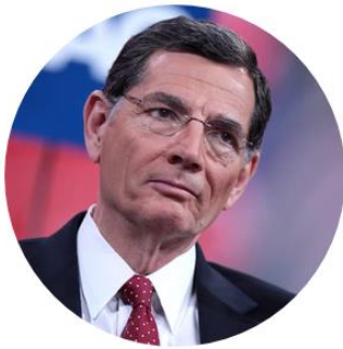
Sen. John Barrasso