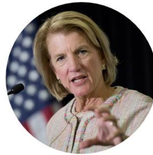
Sen. Shelley Moore Capito

Due to term limit rules in the Senate Republican Conference, Senator Murkowski (R-AK) will no longer chair the Senate Energy and Natural Resources (ENR) Committee next Congress. Should Republicans retain the majority in the U.S. Senate following the general election runoff races in Georgia held on January 5, 2021, Senator John Barrasso (R-WY) announced Wednesday that he plans to follow Senator Murkowski as the new chairman of the committee. Currently Senator Barrasso serves as chairman of the Environment and Public Works Committee and is not yet subject to term limits leading that committee but will cede that chairmanship in favor of ENR. Regardless of the election results in Georgia, with this decision and the expected votes of Republicans on the ENR Committee, it is certain that Senator Barrasso will be the lead Republican member of the committee next Congress. Senator Barrasso's departure from the leadership of the Environment and Public Works Committee leaves the lead Republican role for the Environment and Public Works Committee to Senator Shelley Moore Capito (R-W.V.). Senator Murkowski is expected to remain a member of the Energy and Natural Resources Committee and Senator Barrasso is expected to remain a member of the Environment and Public Works Committee.