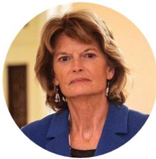
Sen. Lisa Murkowski