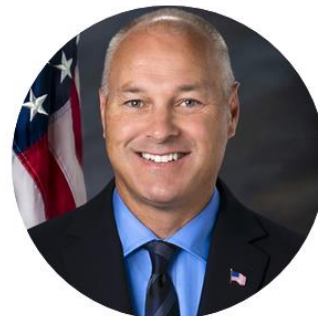
Rep. Pete Sauber (R-Minn.)