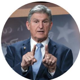
Sen. Joe Manchin (D-W.Va.)

MINEPAC and COALPAC contributed nearly $600,000 through events and direct contributions in 2019-2020 and $222,000 in 2021 to support to pro-mining members of Congress, including: