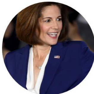
Sen. Catherine Cortez Masto (D-Nev.)