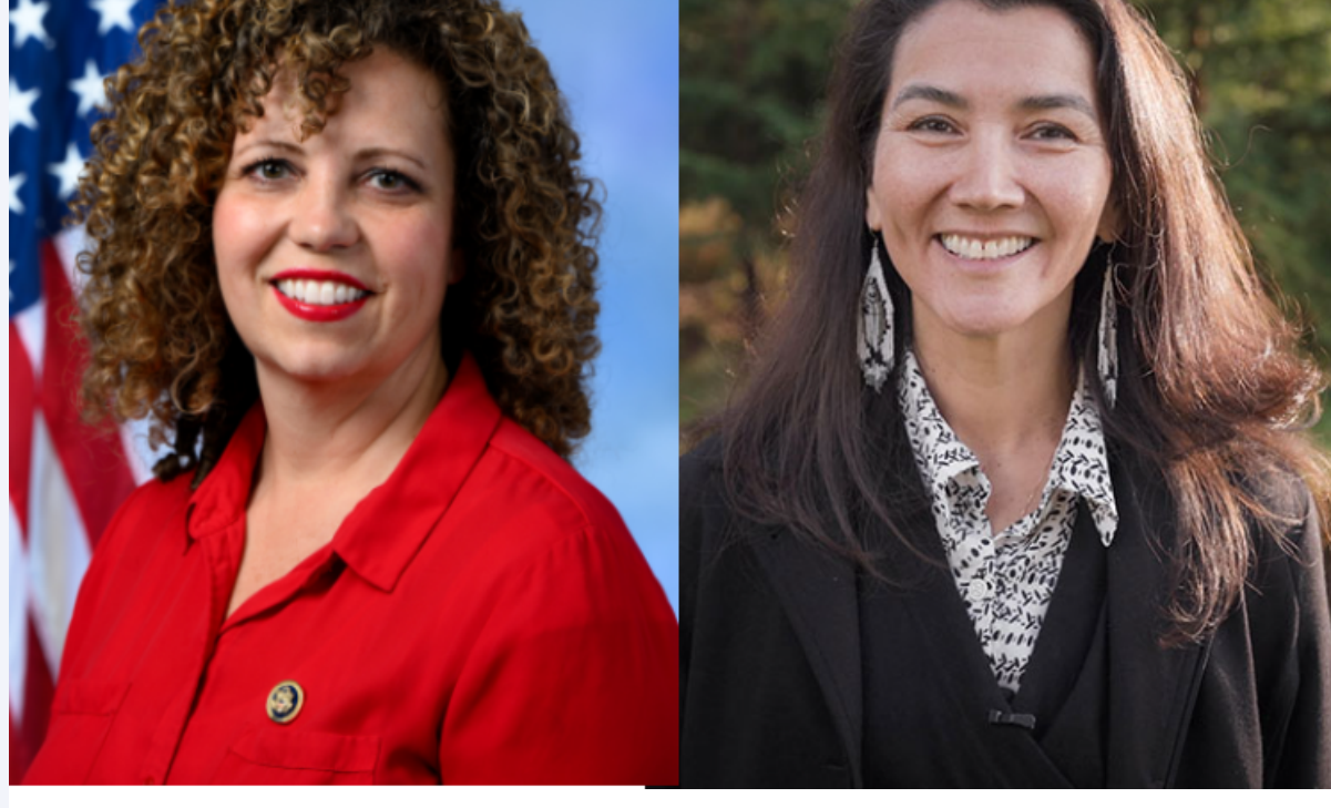
Reps. Celeste Maloy (R-Utah) and Mary Peltola (D-Alaska)

The NMA-backed Good Samaritan Remediation of Abandoned Hardrock Mines Act was introduced in the House of Representatives by Reps. Celeste Maloy (R-Utah) and Mary Peltola (D-Alaska) last month. The House introduction represents the first time ever that Congress had legislation with bipartisan co-sponsorship in both chambers that addresses abandoned mine land (AML) cleanup and liability protections. This bipartisan bill is the companion legislation to S.2781, introduced by Sens. Martin Heinrich (D-N.M.) and Jim Risch (R-Idaho), which has 34 bipartisan cosponsors and passed out of the Senate Committee on Environment and Public Works unanimously.